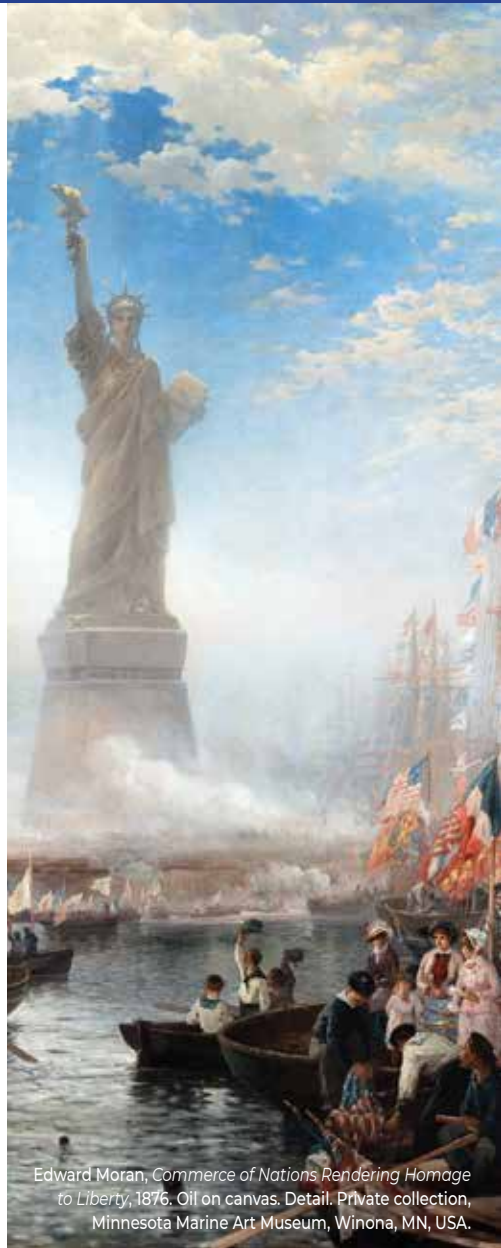
Edward Moran, Commerce of Nations Rendering Homage to Liberty , 1876. Oil on canvas. Detail. Private collection, Minnesota Marine Art Museum, Winona, MN, USA.

With a nod toward Veterans Day and celebrating the freedoms won for our country, our first chamber concert will center on a magnificent and monumental painting by Edward Moran and include compositions by the patriotic American composer Randall Thompson. Exploring the effect of luminism in creating lightness and clarity, this program emphasizes the use of color modulation in the artwork and tonal color of the newly invented clarinet, which fascinated Mozart and inspired his Clarinet Quintet.