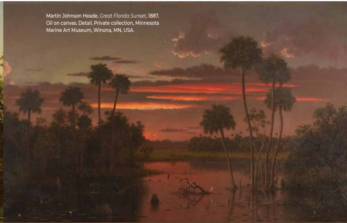
Martin Johnson Heade, Great Florida Sunset , 1887. Oil on canvas. Detail. Private collection, Minnesota Marine Art Museum, Winona, MN, USA.

At our final concert, we welcome back the musicians of the Apollo Music Festival who concluded our last season with the magnificent Beethoven Triple Concerto. Returning with another stirring program, they will perform pieces by two preeminent American women composers.